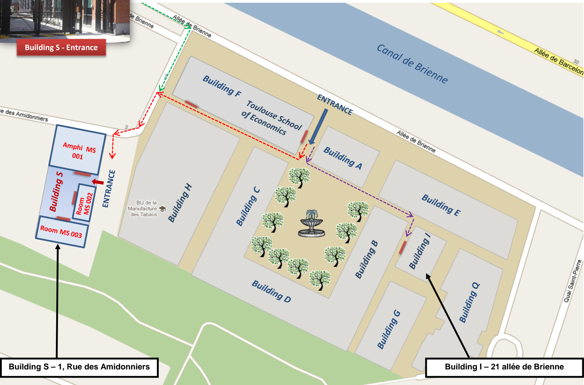
Building S – 1, Rue des Amidonniers