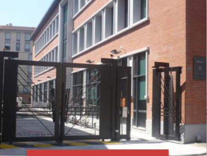
Building S - Entrance